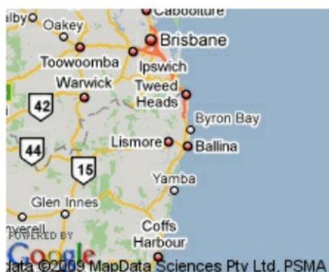
Northern Rivers, NSW

"I feel I wouldn't be alive without the support of BGF. Whenever I came into the office everyone was always so kind and respectful, making me feel as though there was at least one place I always felt welcome." – BGF Client