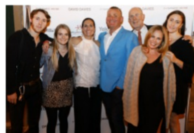
The Team at Yakkazoo