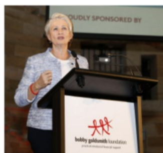
Deputy Lord Mayor Professor Kerryn Phelps

"I would like to congratulate the Bobby Goldsmith Foundation on its work over the decades and thank you all for your contribution." Professor Kerryn Phelps, Deputy Lord Mayor.