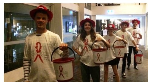
OSCEFA volunteers get in the spirit for the occasion.

These donations are made possible by the support of participating venues, production leads who promote the collections after each show, and all the audience members who so generously opened their wallets to support people living with HIV.