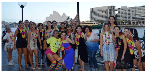
Dancers had a great time with Disco D Tours!