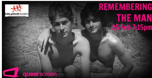
Cinema promo for Remembering the Man

Queer Screen's Mardi Gras Film Festival was a go-to festival earlier this year!