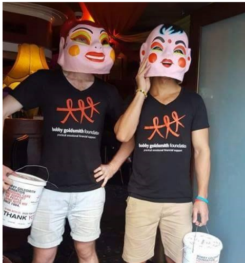
Volunteers wearing masks from the exhibition while shaking BGF donation buckets.