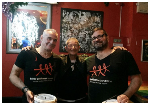
Volunteers at Stonewall

Volunteers shook buckets at Pride Launch on 10 th June, and at the Polly's Pride Fundraiser on 12 th June. We're so grateful that over $400 was raised.